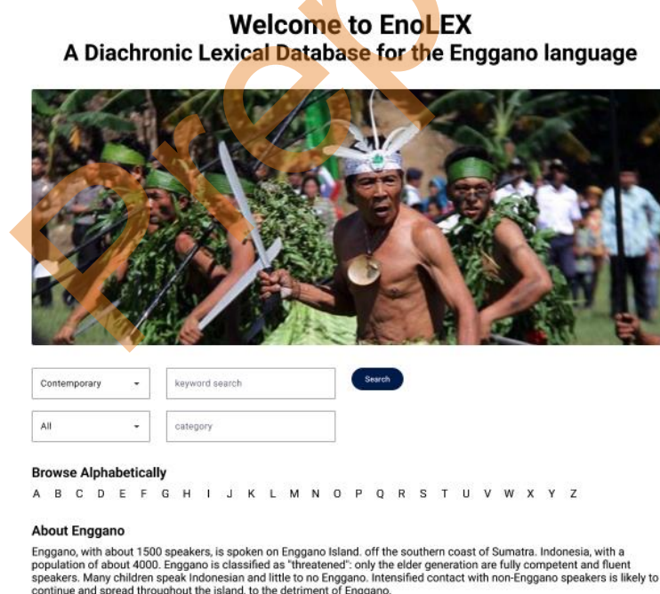
Figure 6. The landing page for the prototype. 16

The mid-fidelity prototype tests and refines the core features of the EnoLEX database, focusing on (i) detailed user interfaces and interaction (for a more accurate representation of the user experience), and (ii) data management (Pramartha et al., 2023). The prototype serves to bridge the gap between initial wireframes and the final high-fidelity product (Engelberg & Seffah, 2002). Using Figma for the prototype development (available at https://s.id/26Ed9 ) allows for collaborative design and easy iteration based on feedback.